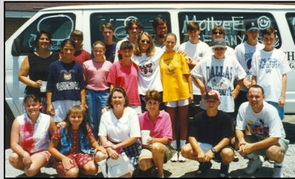
Trinity's Students heading to Super WOW in 1995