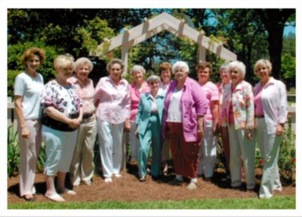
God's Companions Ministry in 2012

In addition, God's Companions supports others through their ministry to our local hospice. If you are a widow in our congregation who has not yet joined this ministry, please consider becoming a part. You will be encouraged and blessed by the friendships you will develop! The time and place of the monthly meetings will always be announced in the Sunday bulletin.